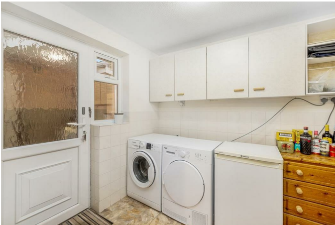
Utility Room 7'1" x 8'7" (2.17m x 2.63m)

UPVC double glazed door and window to side. Wall units. Partially tiled walls. Radiator. Plumbing for washing machine. Space for tumble dryer. Vinyl flooring.