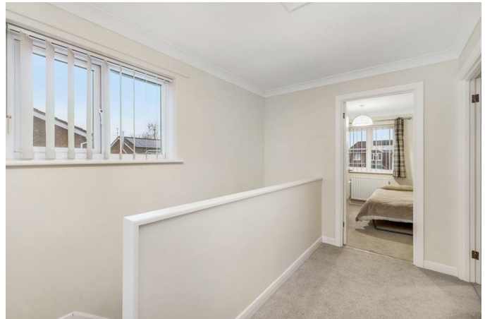
First Floor Landing 11'6" x 7'7" (3.51m x 2.33m)

UPVC double glazed window to side. Loft access. Airing cupboard housing hot water cylinder and shelving. Carpeted.