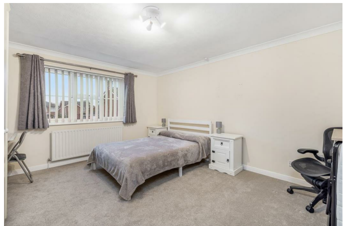
Bedroom 2 12'2" x 13'11" (3.71m x 4.26m)

UPVC double glazed window to side. Radiator. Carpeted.