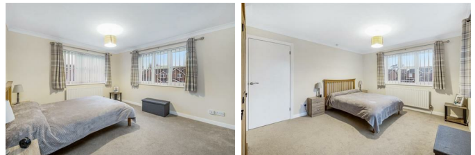
Bedroom 1 14'7" x 11'5" (4.47m x 3.48m)

UPVC double glazed window to front and side. Radiator. Carpeted.