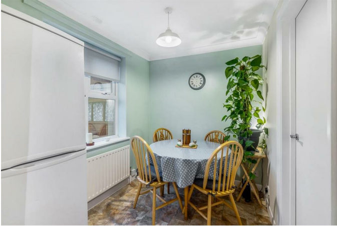
Breakfast Area 6'5" x 8'7" (1.97m x 2.63m)

UPVC double glazed window to rear. Radiator. Electric heater. Viny flooring.